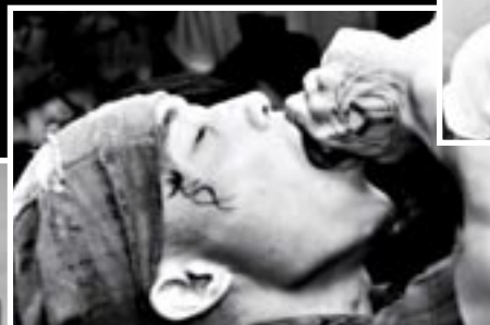
rhythm of survival-jan09