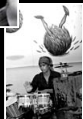
rhythm of survival-jan09